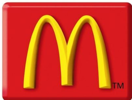
West Lakes, Croydon